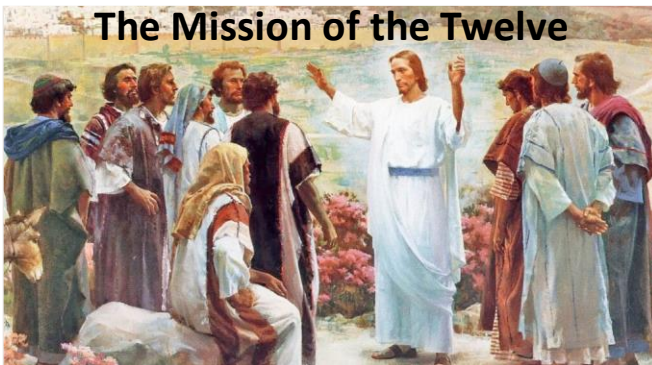
The Mission of the Twelve